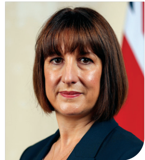
Official portrait of Rachel Reeves MP

From a longer term, strategic viewpoint, avoiding an annual cycle of Budget and quasi-Budgets makes sense, especially when, as now, the gap between events is only a few months. Many countries manage with only one yearly budget, resorting only to supplementary budgets when serious problems arise. Ironically, in the UK that might need to happen soon, depending upon developments in the Middle East.